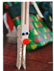
Reindeer ornament $1

Pay instructor individually for crafts you want to make!