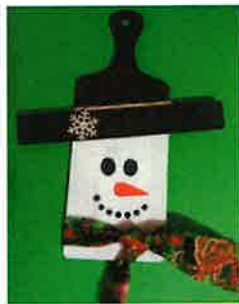
Cutting Board Snowman $4