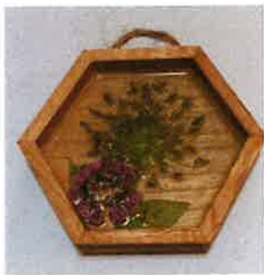
Resin Flower $5