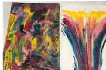
Painting $4 8x10 $2 5x7