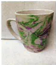
Nail Polish marbling $5