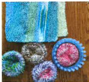
Loomed Scrubbie $5