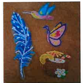
Diamond Painting magnets $5