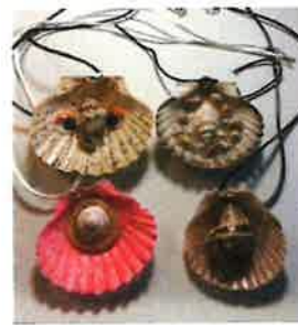
Shell jewelry $5