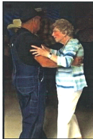
Friday Night Dance