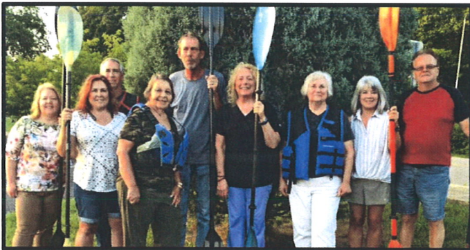
1st Meeting of the Gather at the River Kayak Group