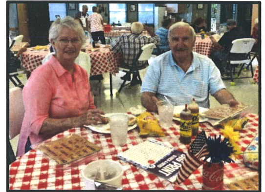
BBQ Bingo Lunch Sponsored by AHA