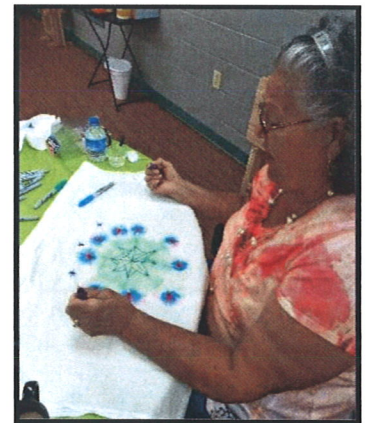
Magic Marker Tie Dye