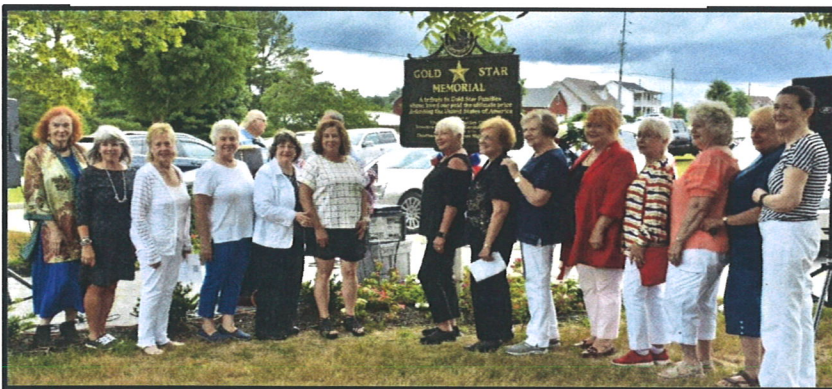
1st Saturday Garden Club Gold Star Marker Dedication at Veteran's Park