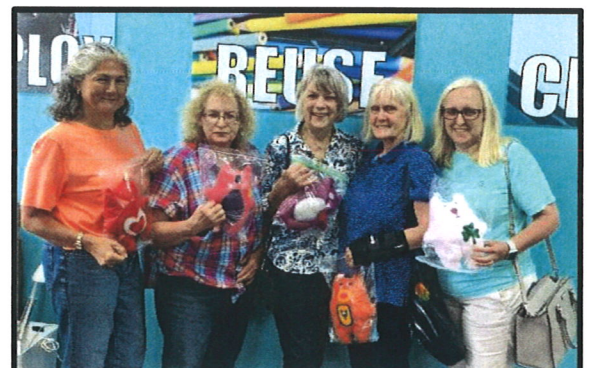
Friday Afternoon Tripoley Players